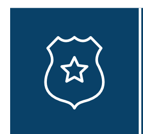
It's the law and you don't want to be taken to court